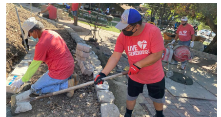
Thrivent Action Teams create impact.

designation. Every dollar counts to these organizations that are experiencing tough times for fundraising due to the pandemic. Your designation of 2020 choice dollars must be complete by March 31, 2021.